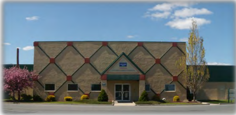
Green Hills Commerce Center